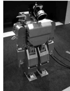
Fig. 2. (left) UML class diagram of the agent architecture used in the Senchans team. It shows the core classes of the system in the different layers. The modular design allows for easy extensibility. All sensory information from and to the robot is handled by the interaction layer. The information stored in structures of the skills layer, which also provides methods for predicting the future world state. These are used by classes in the decision layer to determine the best action of the agent for the current situation. (right) The HOAP-2 robot used in the Senchans team.

The design is based on modules with a high inner cohesion and low coupling between the different modules. The behaviors are implemented as dynamic modules which can be loaded at runtime. Because of this plug-in mechanism, the other classes of the architecture don't need to have any knowledge about the inner workings of the behaviors. The robots' behavior can be changed easily, without having to recompile any code, by simply loading a different behavior module according to the present situation.